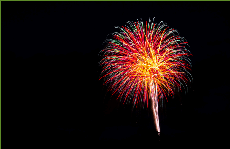
Photos from Wildwood's 2023 Happy Birthday America event.

Admission is free. To preregister for the pie eating contest, go to wildwood-fl.gov/parksrec or call 352-461-0134.