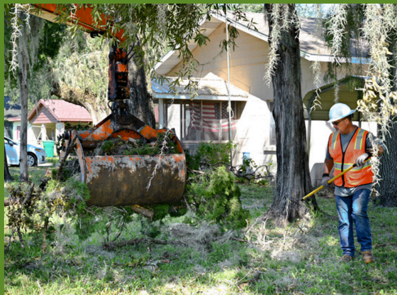
Above, Wildwood crews worked extended shifts to clean up vegetative debris strewn by Hurricane Milton.

"Handling this work ourselves, rather than contracting it out, is a big undertaking but allows us to do clean-up faster and more efficiently," McHugh said.